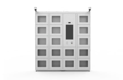
Intelligent Valuables Storage Locker