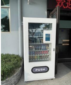
Vending Machine - Aman Seasons Hotel