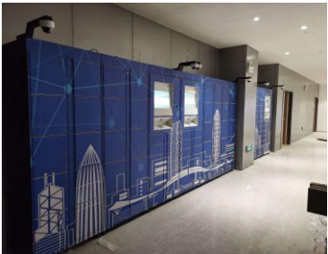
Courier Locker - Treasury Payment Center of Futian District Committee